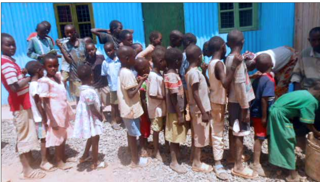
Children wait in line for grain provided by GRACE and its partners in East Africa.